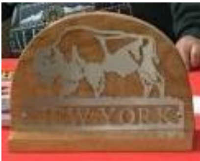
The new BSC Buffalo (see page 4)