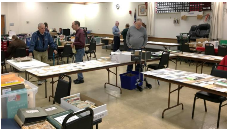
Bidders inspect the lots at the Silent Auction