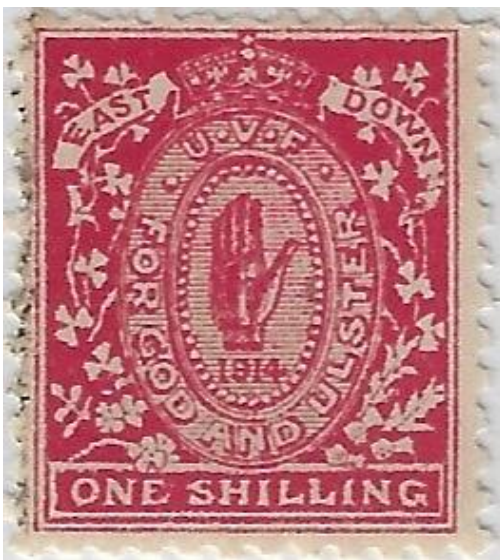
East Down Label