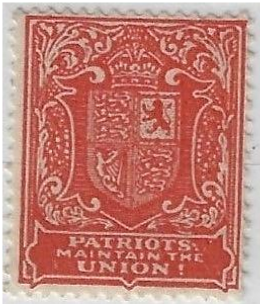
Patriots Maintain the Union label

Ireland on July 28, 1914 was in the throes of a revolutionary war with England when World War I was declared. Irishmen were slow to declare. They eventually fielded the Irish Army to fight the Germans.