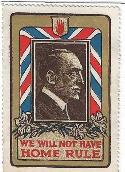
Sir Edward Henry Carson was known as the "uncrowned King of Ulster"

The Government of Ireland Act of 1914 was the third such Home Rule bill to come before Parliament, and it finally passed, but was never enacted due to the work of Carson. Redmond's influence collapsed when he agreed to the Ulster partition, and that Irish men would serve under the English flag in World War I.