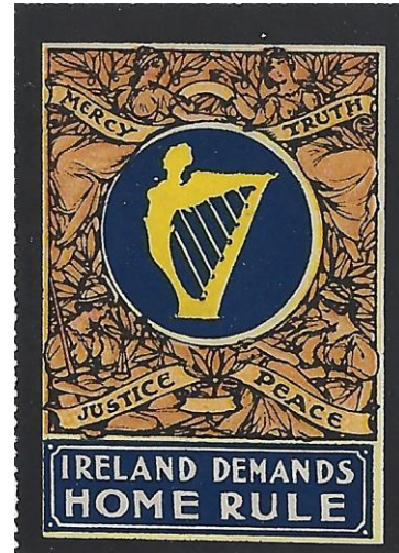
The harp is the heraldic symbol of Ireland