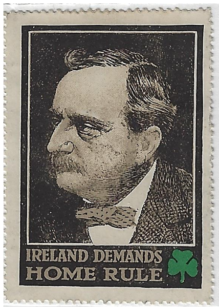
John Redmond - Home Rule leader. Devoted his life to Home Rule.