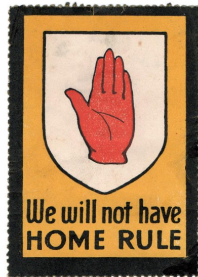
The Red Hand of Ulster.