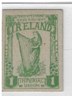
Dull Yellow Green on Card