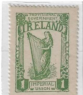
Dull Yellow Green