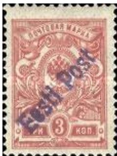
Estonia Issues with one overprint on a Russian stamp

The stamps issues starting from 1915 are immensely different and offer a wide variety of collecting sidelines. Many are inexpensive and readily available. This is a wide-open collecting area with affordable prices to build a nice collection. Here are some illustrations: