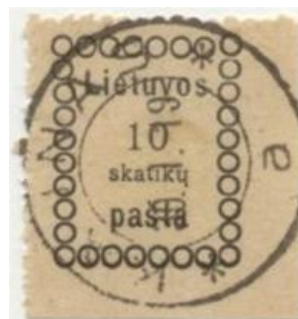
First Home Printed Stamp