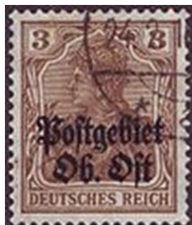
Lithuania Issue – German Overprint