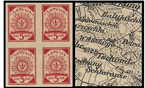
Printed on old maps

One key factor was the shortage of paper. Latvia used any source on hand, such as obsolete bank issues, German maps, and already used envelopes were repurposed, and many issued both imperforate and perforated.