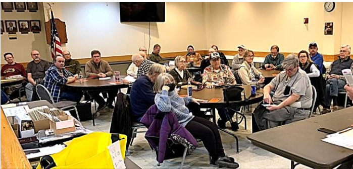
A sizeable crowd of Club members patiently await the lot description to start the spirited bidding.