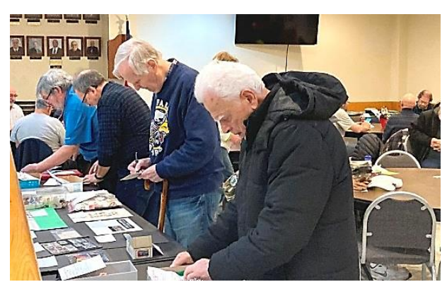
Nice crowd on hand for the January Meeting/Auction