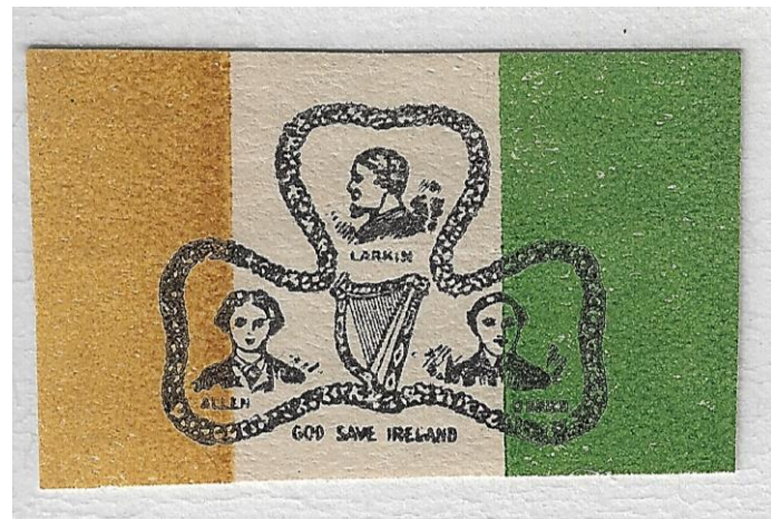
Manchester Martyrs label: Irish Flag overprinted with Allen, Larkin and O'Brien with "God Save Ireland"

In 1867, three Fenian Brotherhood members were hanged in Manchester: Philip Allen, Michael Larkin, and Michael O'Brien.