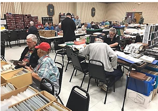
More busy tables