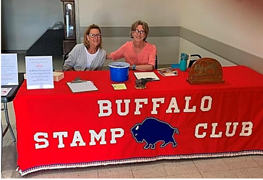
The Welcome Table