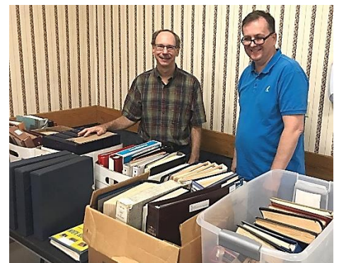
Rummaging thru bins