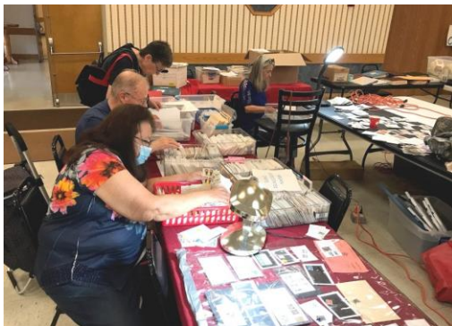
The Cover Connection