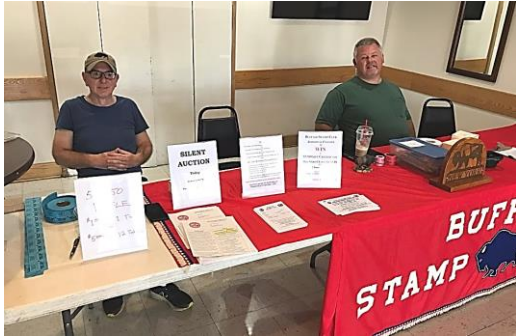
The Hospitality/Welcome Table