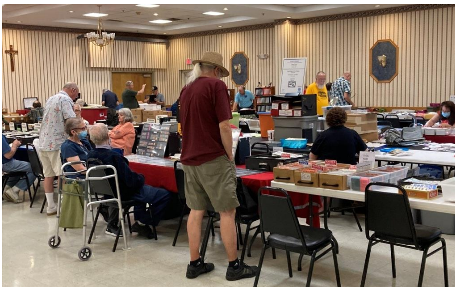
A steady day at the Show