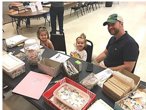
Dad with grandkids at Kids Corner