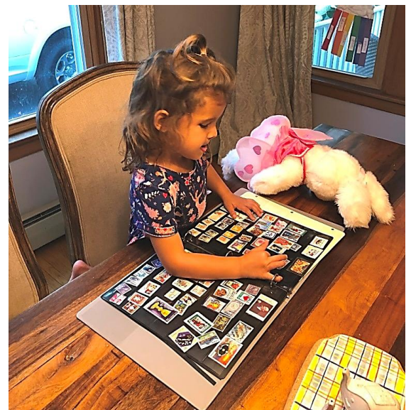
At home, Dad says, "She's hooked!"