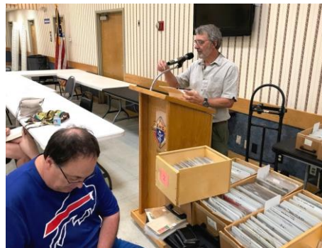
Calling out the hourly winning ticket