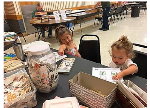
Busy picking thru all those stamps