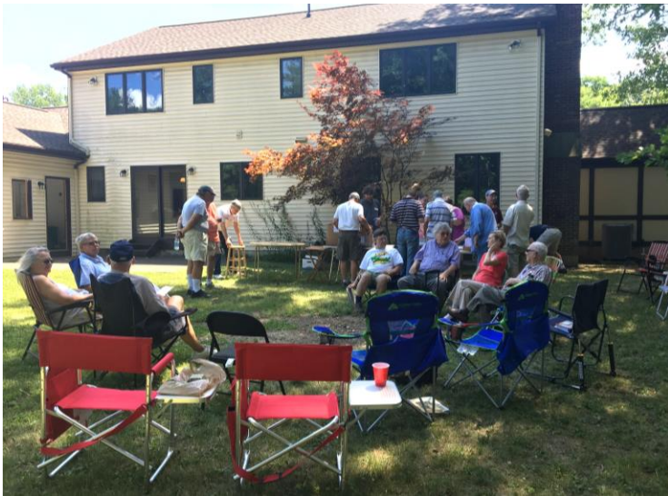
Gathering for the Auction following lunch