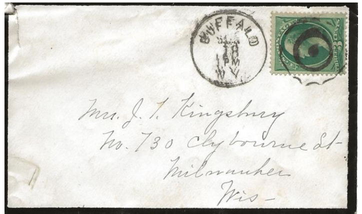
A mourning cover with Buffalo postmark!

Today, we live in an age where news is conveyed instantaneously through cell phones and social networking. It is difficult for our younger generation to understand how people communicated before the advancement of technology. Showing the cover to young high school students, they were amazed how people communicated through the mail and waited so long for a response. Some insisted that the cell phone was invented right after Alexander Graham Bell invented the telephone!