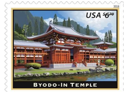
Scott 5257 issued in 2018 paid the Priority Mail rate

The April 13 th auction had several lots with high denomination US stamps. These stamps paid various rates of the priority and express mail USPS products. They are nice additions to any US collection.