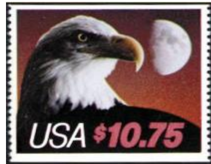
Scott 2122 issued in 1985 paid the Express Mail rate

The catalog value for a mint Scott 2122 is $19 while a MNH Scott 5257 is $11.90. Besides being nice additions, Scott typically values these stamps high not only because of the high face value but because of their scarcity.