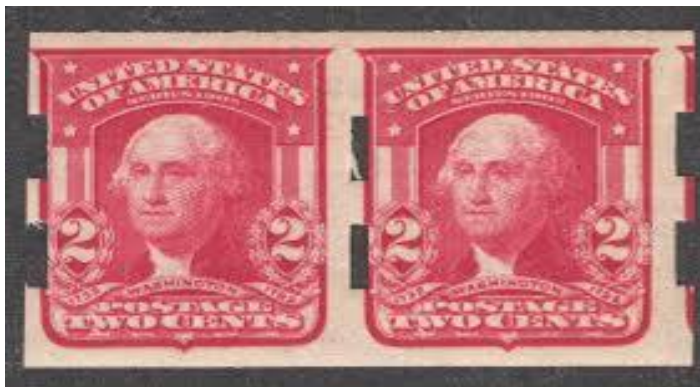
An example of an unused pair of Scott 320Ad

Lot 64 at the auction on September 22 was noteworthy as it had one of the highest realizations in recent Club memory. It was a Scott 320Ad, 2 cent Washington, carmine, Type II, 1908, used, fine condition, Schermack Type III perforation. It had a tiny nick in the top left edge but came with a certificate issued by the American Philatelic Society. It is found very rarely used and has a catalog value of $2,500. The asking price was a mere $475 and sold very easily without any begging or cajoling! Congratulations to the buyer of this gem!