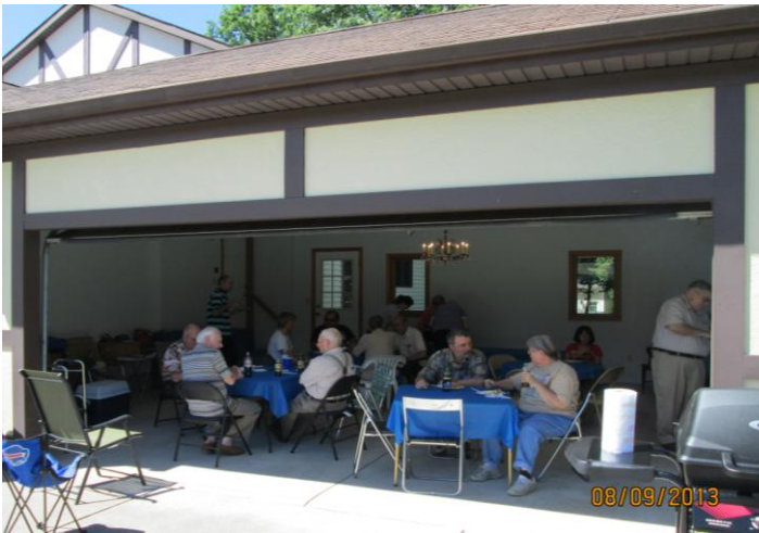
Members enjoying the Summer Picnic